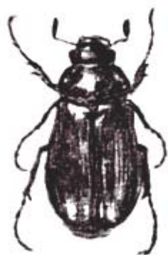
Adult (actual size is approximately 1/2 inch)

Rhizotrogus majalis (Razoumowsky); Family: Scarabaeidae